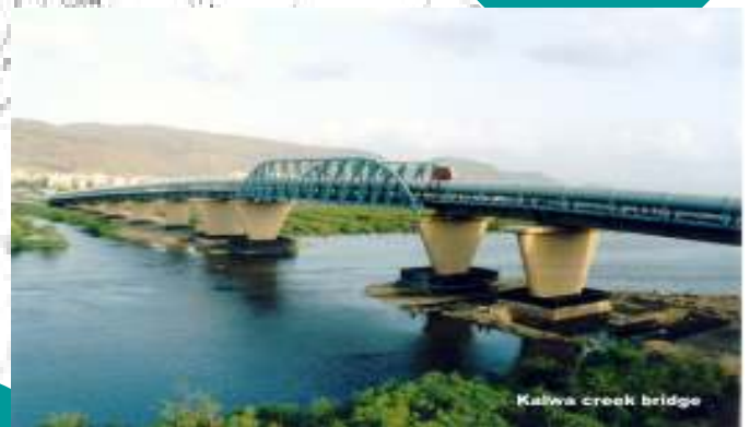
Kalwa creek bridge